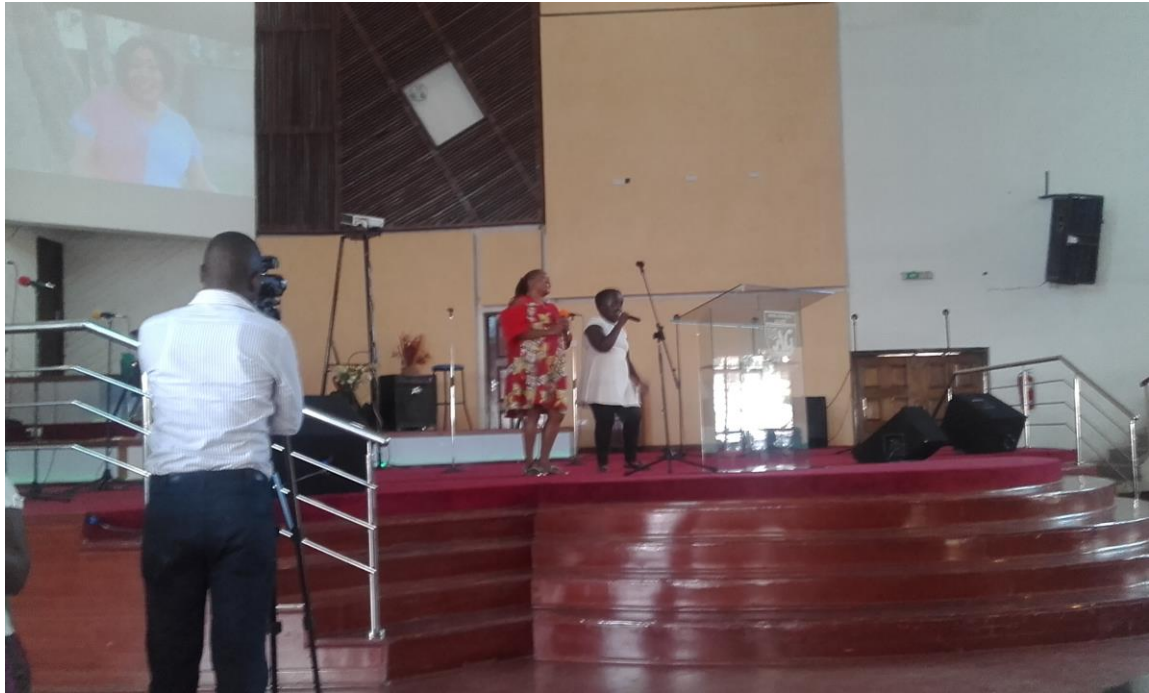
We had involved other disabilities: