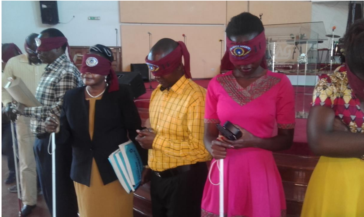
Church Elders Also marked the Disability Day