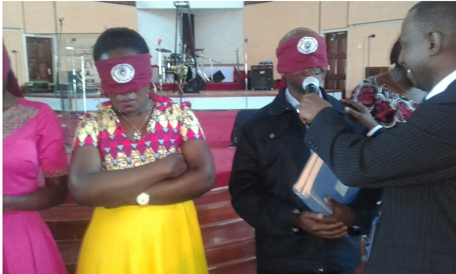
Pastor allowing church members to give testimonies